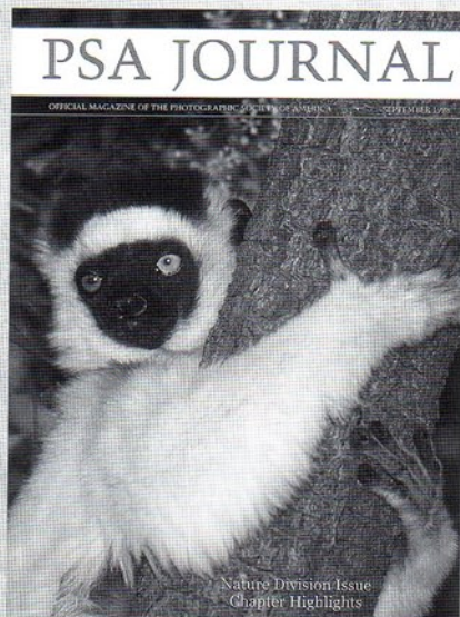
PSA Journal , September 1998