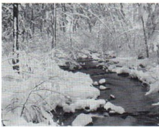
JOURNAL of the Photographic Society of America Vol. I March, 1935 No. 1