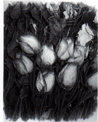
Aged and Beautiful